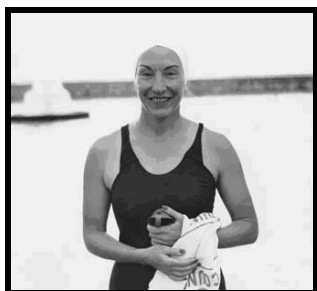
* Florence Chadwick succeeded when she kept the vision in mind.

A long distance swimmer* was attempting to swim the 26 miles from Catalina Island to the coast of California. It was a foggy day and after 15 hours of battling the waves of the Pacific Ocean she wanted to quit. The boats that were following her encouraged her to go on, but after