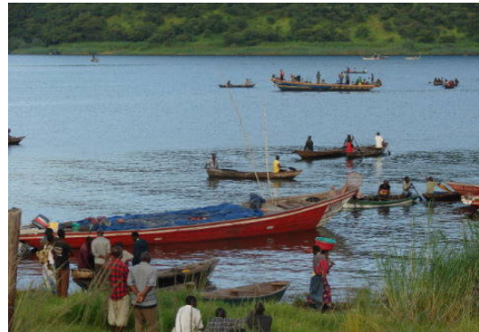
The Taabua people live along the western shore of Lake Tanganyika.

For unto you is born a Savior who is Christ the Lord! Luke 2:11